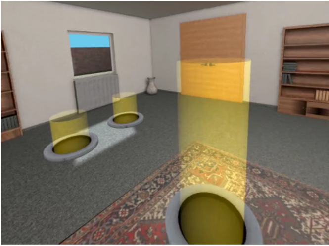
Fig. 1. Exemplary view of the subject: Pillars of different heights, two being out of sight.